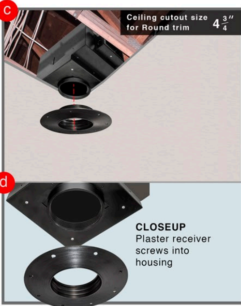
Step C/D - Secure plaster receiver to housing by screwing receiver into housing.