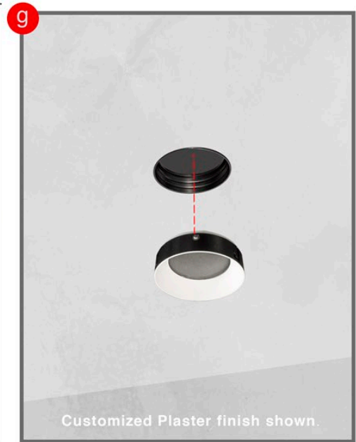
Step G - Multi-layer plaster job over GWB ceiling. Paint over plaster finish.