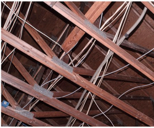
Exposed Ceiling Joists. Connect all wiring for housing before GWB installation.