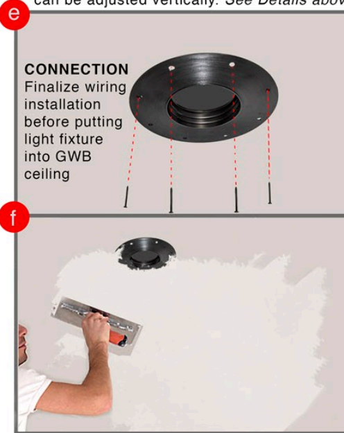
Step E - With Plaster receiver tightly secure against GWB, add GWB screws to further secure plaster receiver. Step F - Apply tape and joint compound (dry). Plaster over ceiling and receiver.